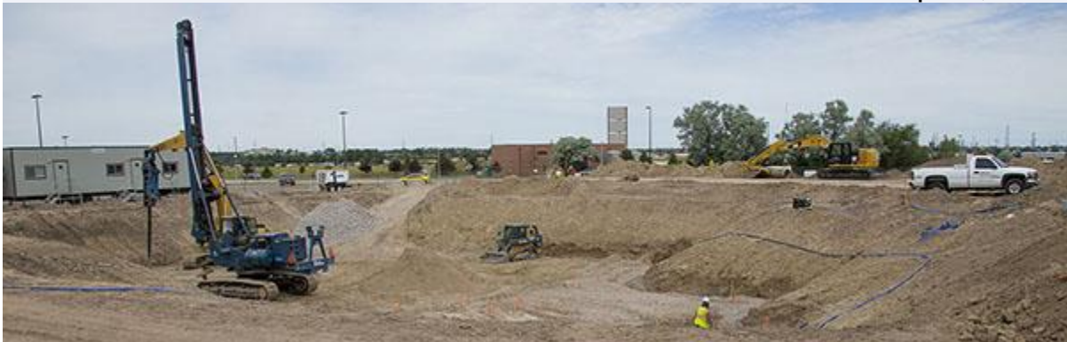
Crews perform foundation work at the site of the new Student Services and University Center at Laramie County Community College.