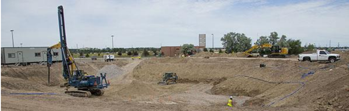
Crews perform foundation work at the site of the new Student Services and University Center at Laramie County Community College.