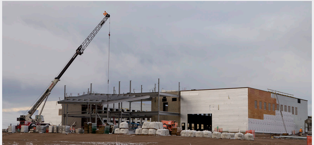
Crews work on the Flexible Industrial Technology building.